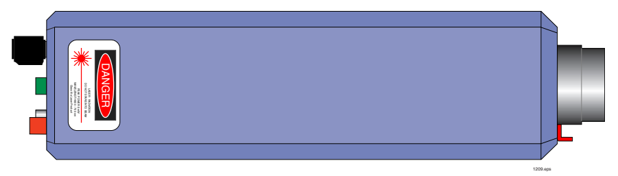
Figure 7. Top view of laser showing the location of the "Warning logotype" label for a Class IIIa laser.

For U.S. guidelines on laser classifications and health standards, refer to the American National Standards Institute specifications governing lasers and laser safety. The guidelines are published by the Laser Institute of America, 12424 Research Parkway, Suite 130, Orlando, FL 32826.