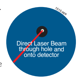
Figure 2. Close up view of the alignment laser beam to receiver aperture.