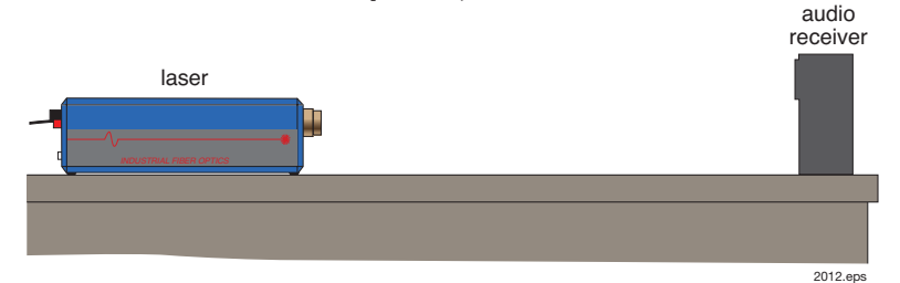
Figure 3. Side view of the laser and audio receiver.