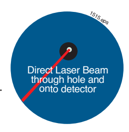
Figure 4. Close up view of the alignment laser beam to receiver aperture.